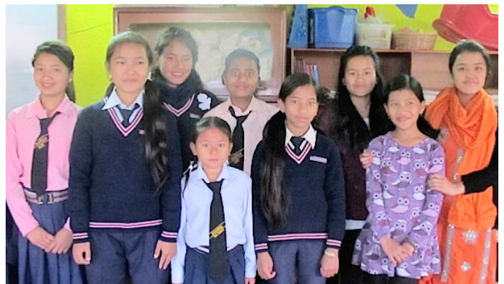
Some of the participants in the Rise Above program.

program to include scholarships for college tuition. We will also teach the girls crafts skills so that they have multiple means of earning a living.