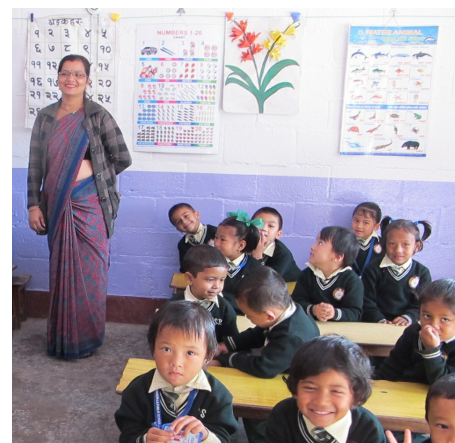
One of the newly renovated rooms.

Thanks to the generosity of donors, we continue to help the Shangri-La School that our children and 900 others attend. A new toilet block was built for the girls this past spring giving them greater privacy and a cleaner environment. The kindergarten rooms were also recently renovated. Work included fixing leaks, painting and plastering, installing electricity and fans, and hanging bulletin boards. We also bought toys for them.