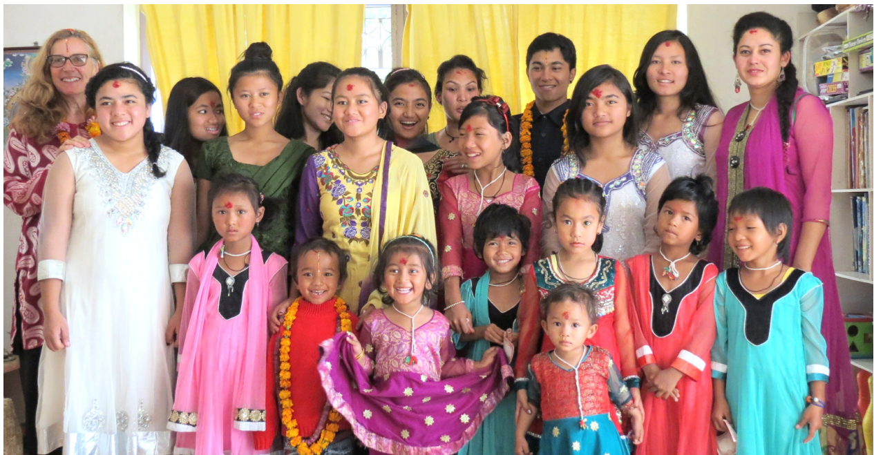
The House with Heart family celebrating Dashain, October 2014.